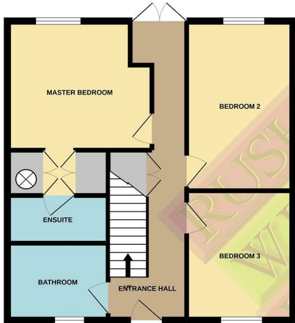
GROUND FLOOR 584 sq.ft. (54.2 sq.m.) approx.